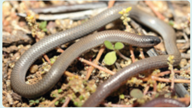
The vulnerable Pink-tailed Worm Lizard ( Aprasia parapulchella ).

The Googong Township / Molonglo Conservation Group $1m co-funded Pink-tailed Worm Lizard Saving our Species initiative is underway with the installation of a perimeter fence to start soon. Mapping of the species has been completed which will allow solid works planning going forward over the remaining 5 years of this project. These works include establishing or improving habitat for the species in specific areas, weed management, native grass improvement and creating an education sanctuary with the installation of walking trails which will be used by the Molonglo Conservation Group for guided tours.