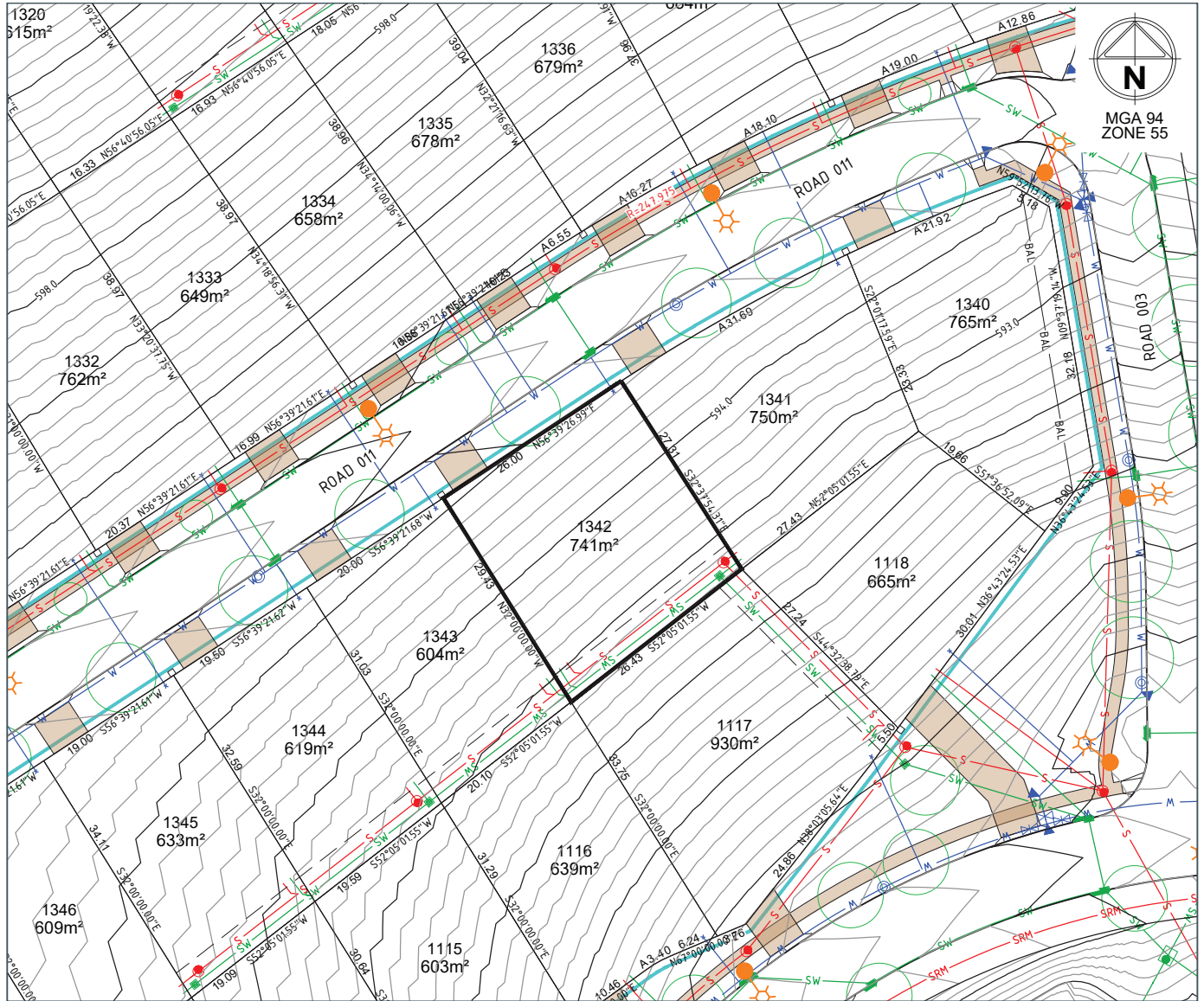
LOT LAYOUT - SCALE 1:400 (A4) REVISION ---- DATE