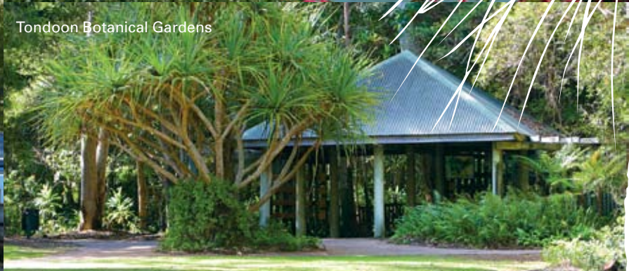
Tondoon Botanical Gardens