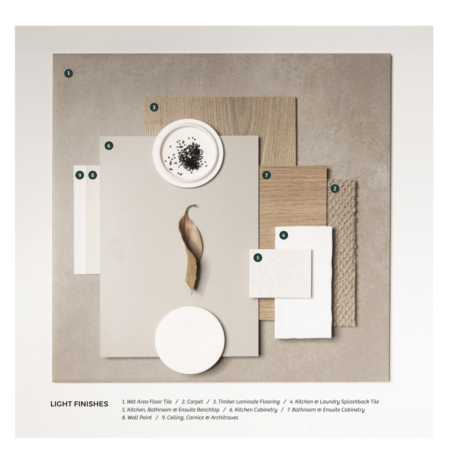
Timeless contemporary living.