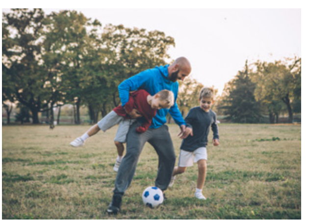
Life at Hummingbird Rise