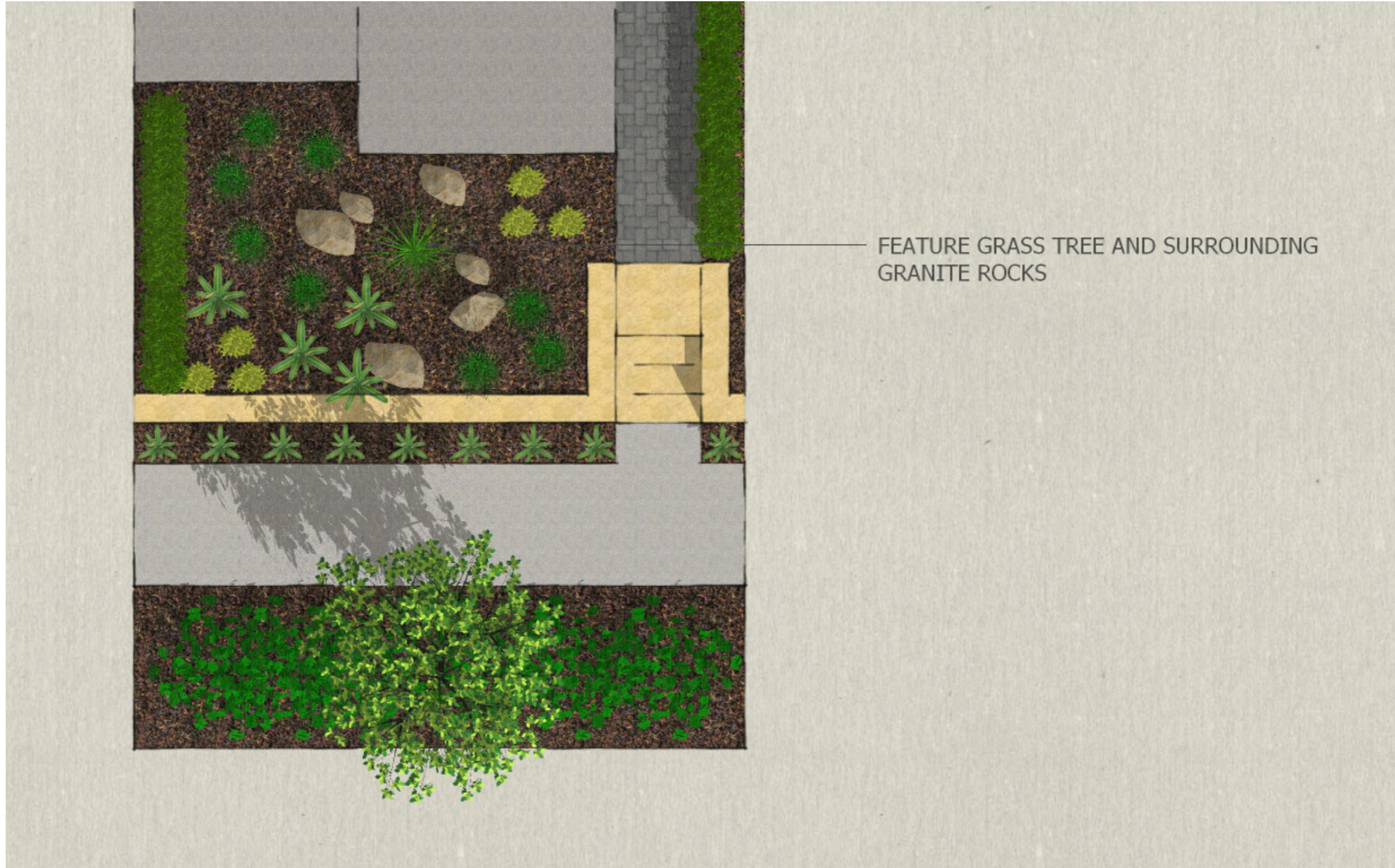
FEATURE GRASS TREE AND SURROUNDING GRANITE ROCKS