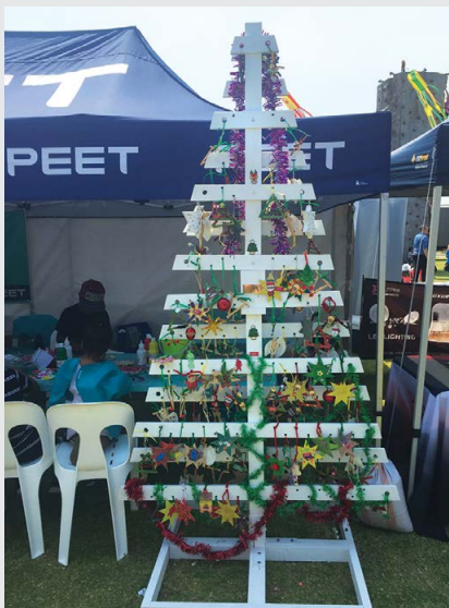
The Community Christmas Tree at Lakefest 2017.

The show was headlined by WA band The Fisher Boys, who after making the finals of Channel 7's The X Factor Australia, are now Sydney-based and don't often get to appear in their home state. An extra special treat for everyone at the event!