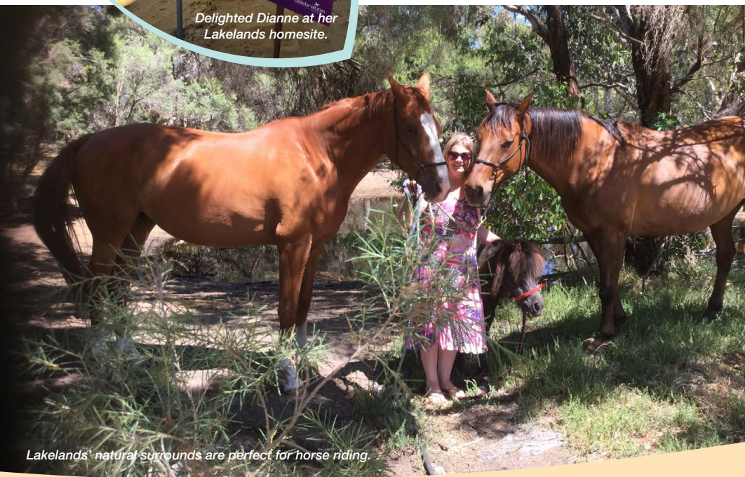
Lakelands' natural surrounds are perfect for horse riding.

Meraki is a Greek word of Turkish derivation which means: a labour of love; to do something with soul, creativity, or pleasure.