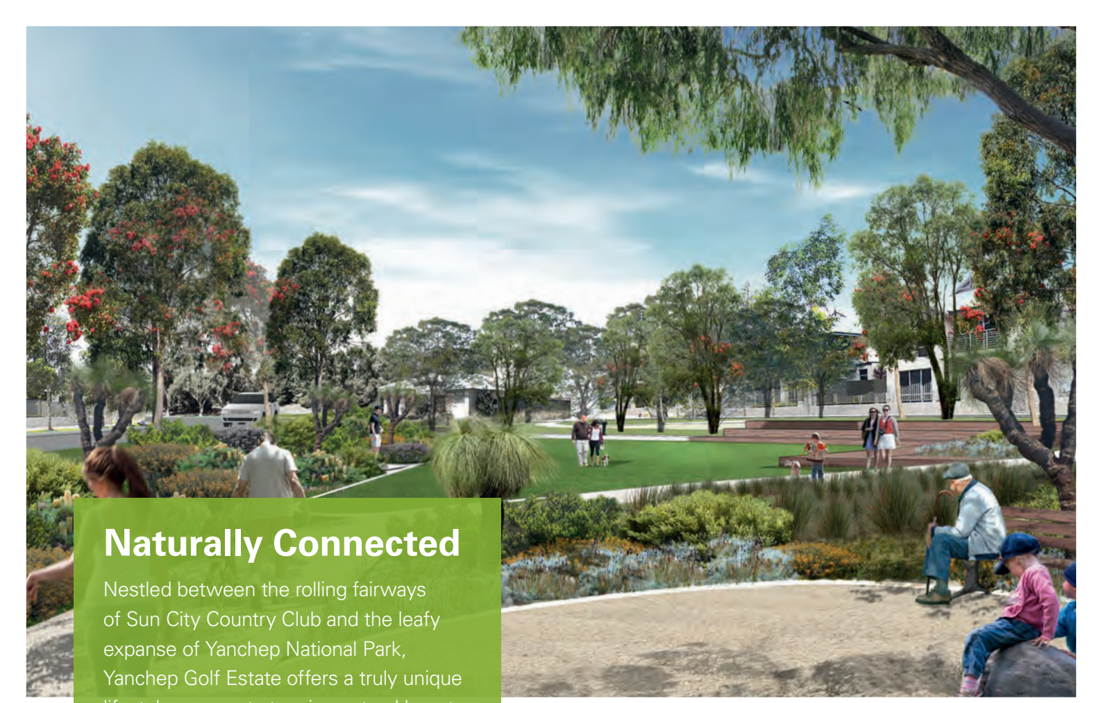
Artist impression only