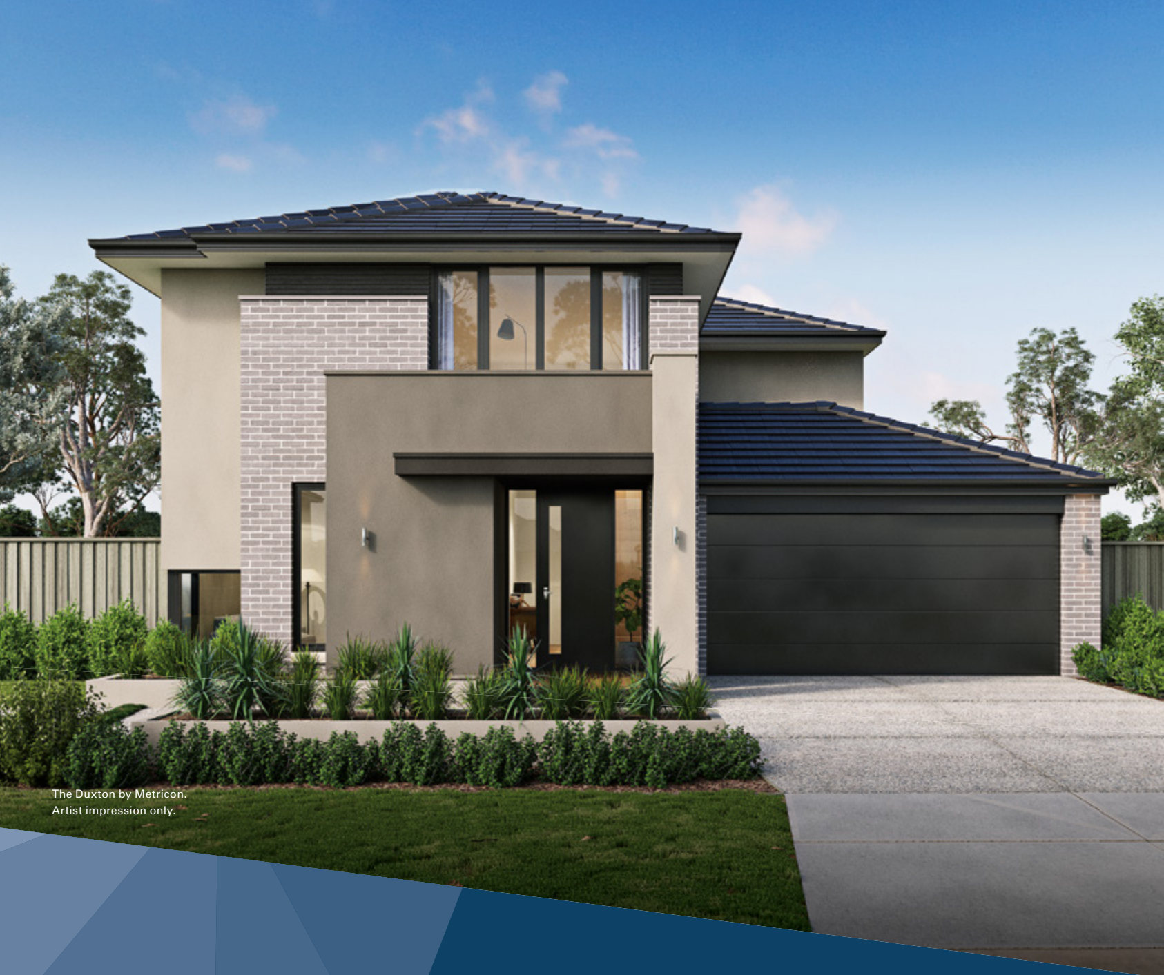
The Duxton by Metricon. Artist impression only.