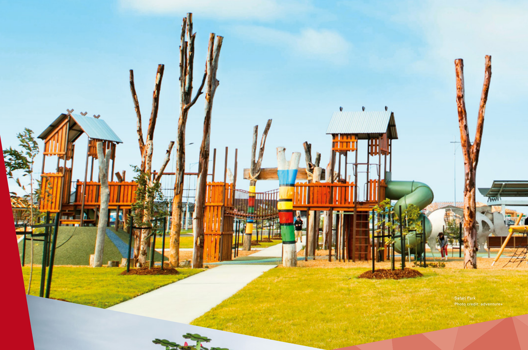
Safari Park