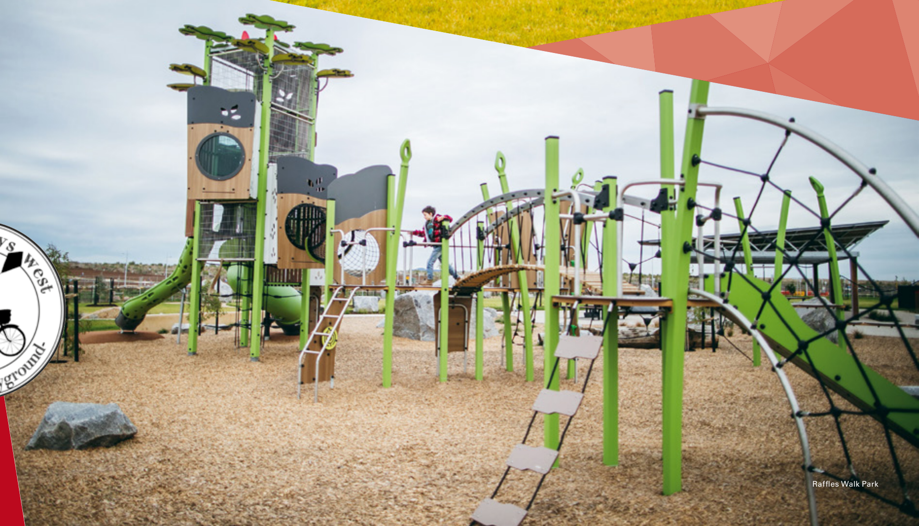
Raffles Walk Park