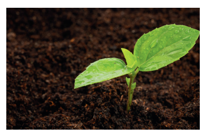
Apply mulch to garden beds to reduce evaporation from soil and minimise expanses of lawn.