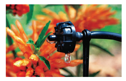
Drip irrigation can be directed onto the root zones of plants.