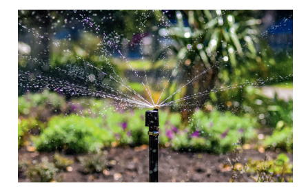
Spray irrigation evaporates quickly.