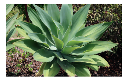
Use waterwise plants that do not require large amounts of water.