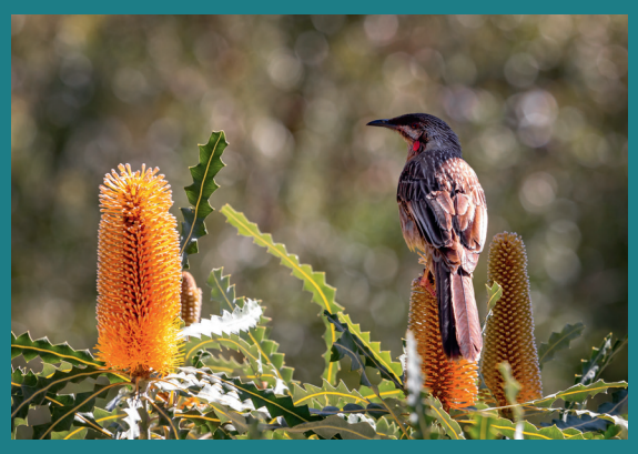
Native plants provide for native wildlife.