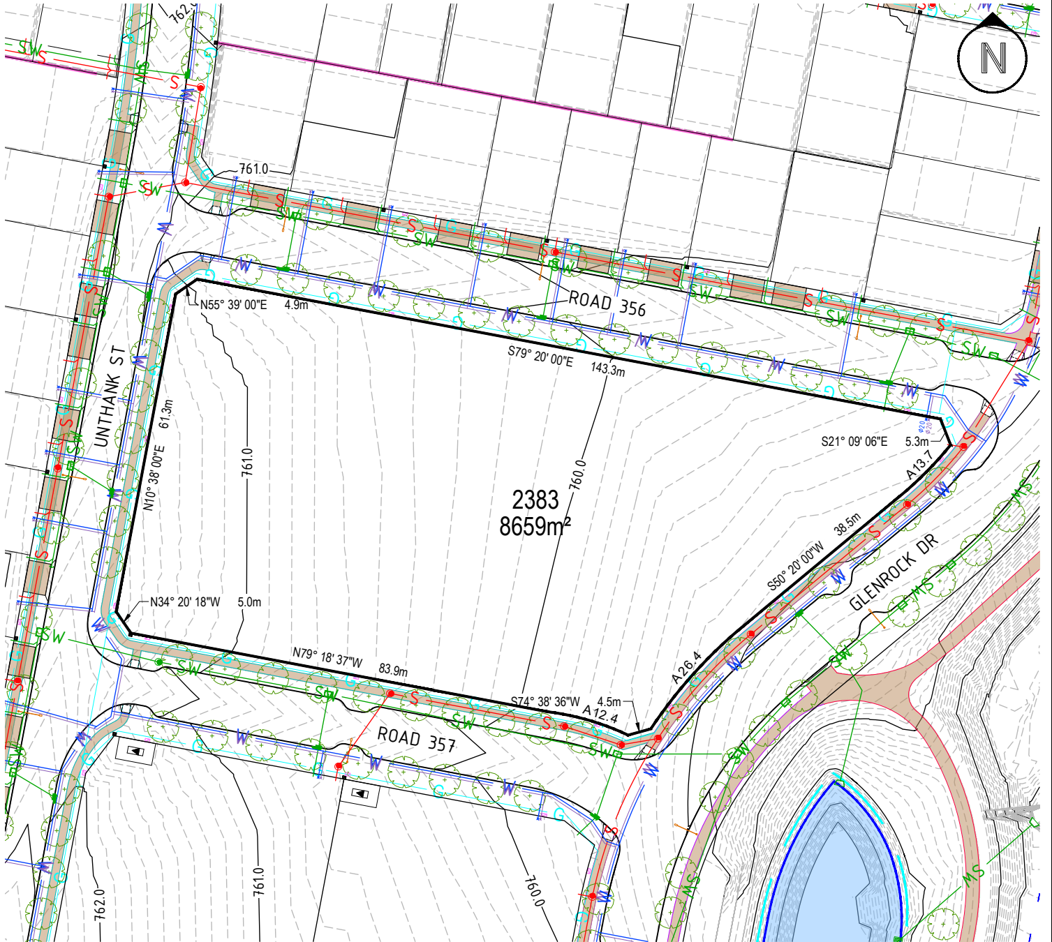
LOT LAYOUT - SCALE 1:1000 (A4)