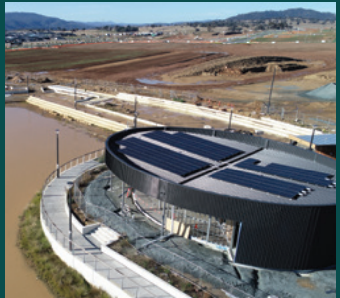
↑ Image: The Googong Sales Office and Bunyip Park hard landscaping are well underway.

Construction of Bunyip Park has ramped back up with the lake side decks and performance stage well underway. Completion is expected in the 3rd quarter of this year.